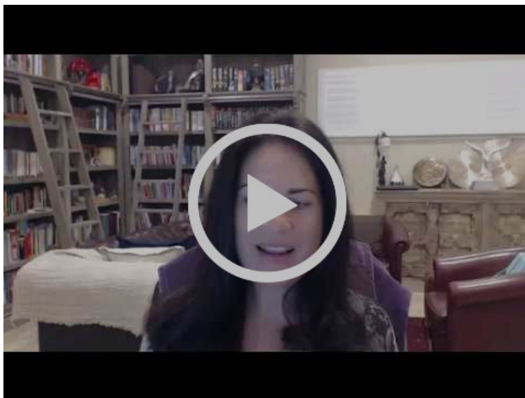
Musings on Manuka essential oil