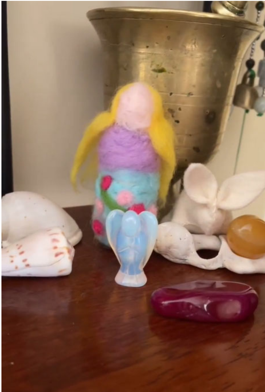
My sacred altar paying homage to Easter with the Sacred Hare, the Goddess Eostre, shells and crystals including the golden egg of abundance in the colours of spring (I am holding space for my Goddesses in the Northern Hemisphere).

Here are some of my altars - I have many scattered around my home, my temple, which I love to beautify with items of love, gratitude, and meaning.