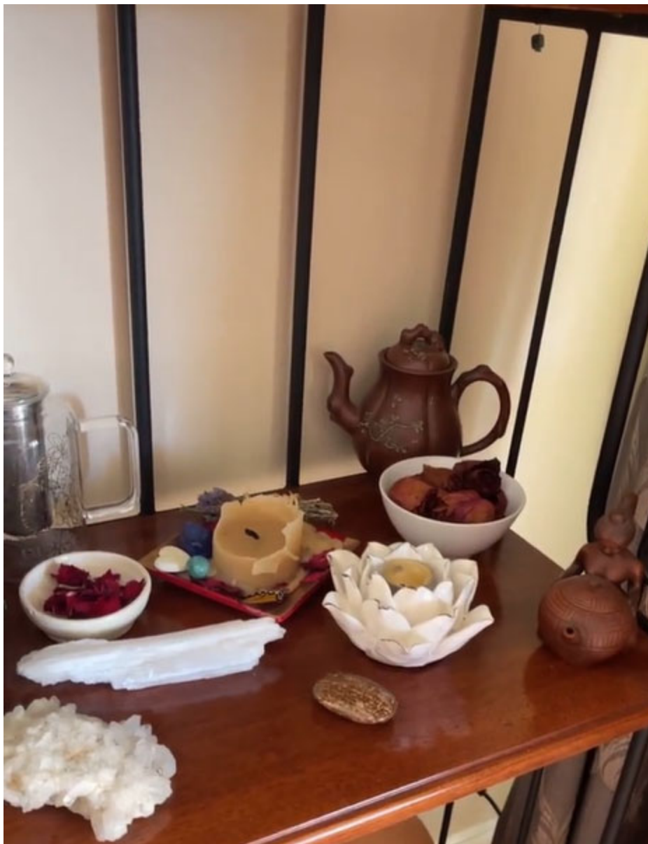
My autumn sacred altar, with red roses I have dried, lavender in a bundle given to me by my daughter, I burn beeswax candles, crystals in autumn colours, gifts from friends and loved ones, items of meaning and devotion.