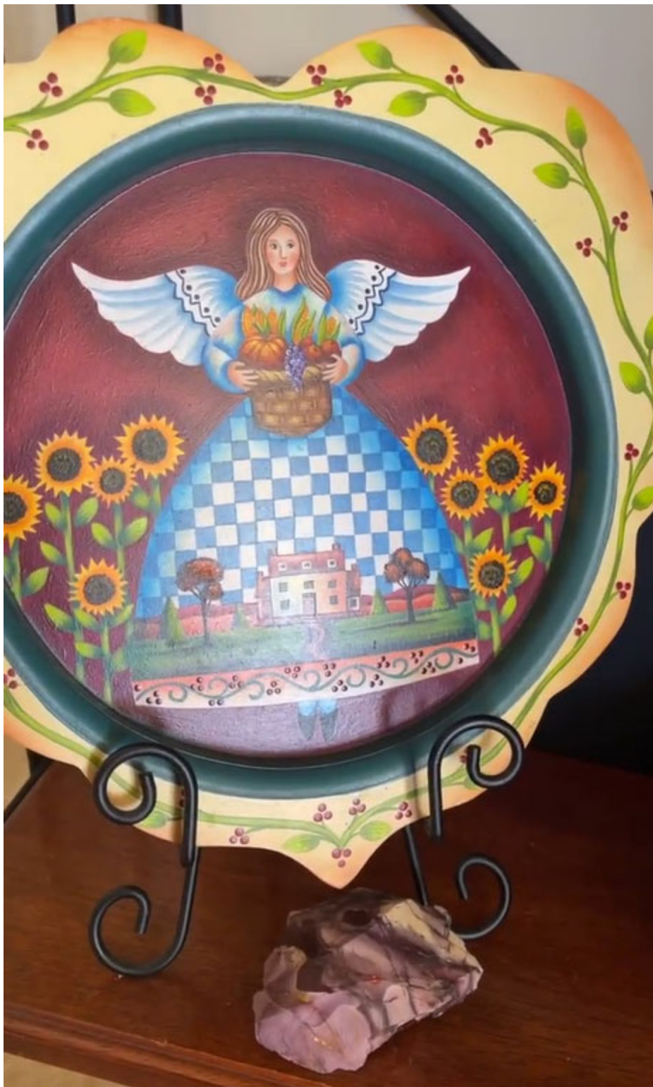
Another altar in homage to the Autumn Equinox, with mookaite, an Australian crystal.