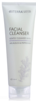
FACIAL CLEANSER 118 ml

dōTERRA Essential Skin Care is a family of skin care products designed to keep your skin feeling and looking young, healthy, and gorgeous by maximising the power of carefully selected CPTG Certified Pure Tested Grade™ essential oils combined with cutting-edge ingredient technologies and natural extracts in each product. Target the visible signs of aging and prevent future signs of aging with dōTERRA Essential Skin Care.