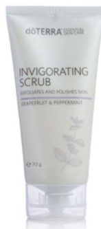
INVIGORATING SCRUB 70 g

dōTERRA Essential Skin Care Facial Cleanser is designed to be used daily, morning and night, to help keep the skin clean and pure. Natural cleansers of Sodium Cocoyl Isethionate and Stearic Acid gently wash away impurities, leaving skin looking clean, fresh, and smooth. This cleanser also contains Tea Tree and Peppermint CPTG essential oils, known for their refreshing aromas, to make your facial care experience all the more enjoyable.